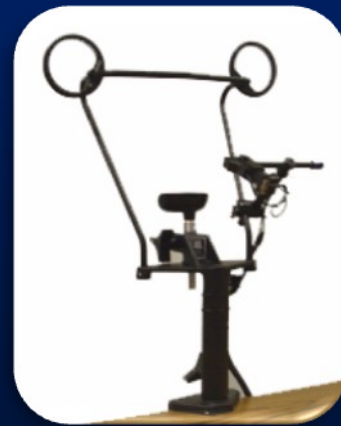
EYESTART – Forehead Chinrest Option

Tel.: (781) 275-4000 Fax: (781) 275-3388 www.asleyetracking.com Email: asl@asleyetracking.com