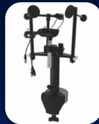
EYESTART – Cheekrest Chinrest Option