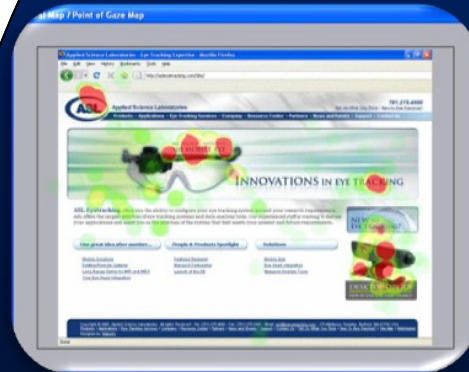
One of the many graphic presentation images from ASL Results.

Tel.: (781) 275-4000 Fax: (781) 275-3388 www.asleyetracking.com Email: asl@asleyetracking.com